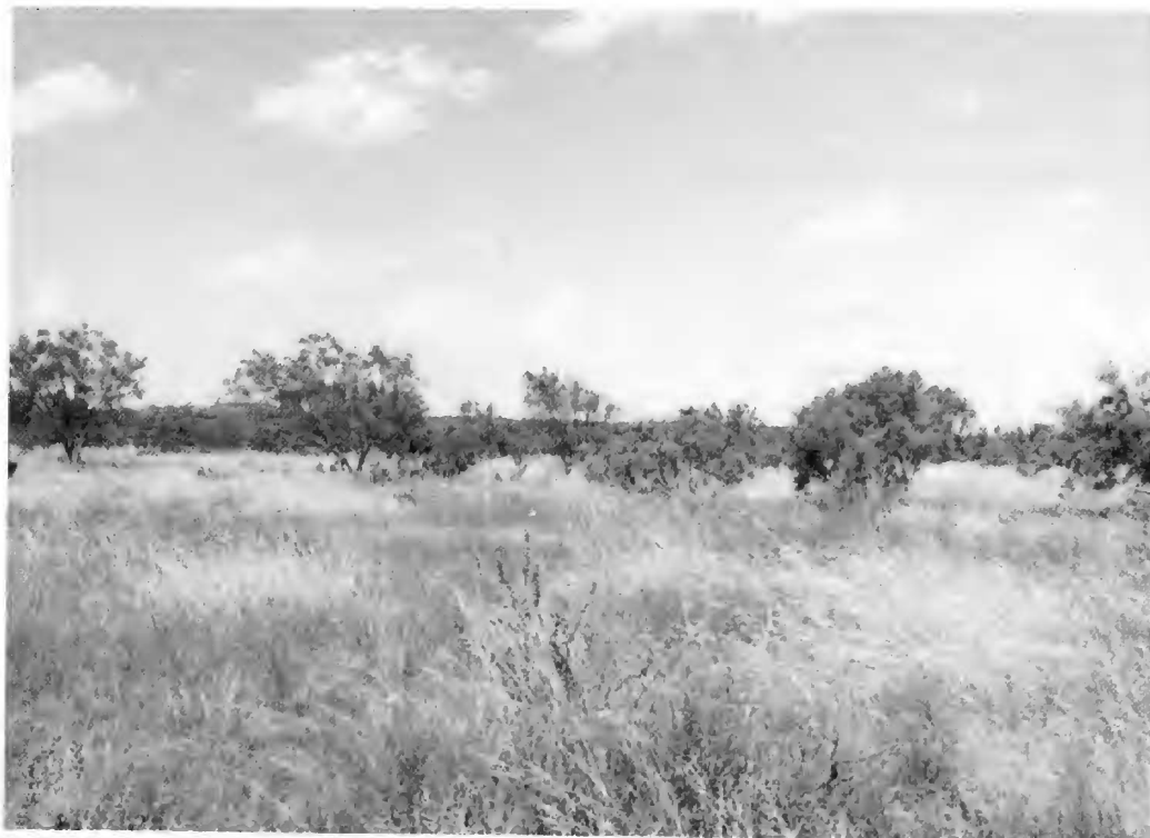
Fig. 4. Light mesquite-mixed grassland near the South Concho River. This site demonstrates secondary succession following brush control measures.